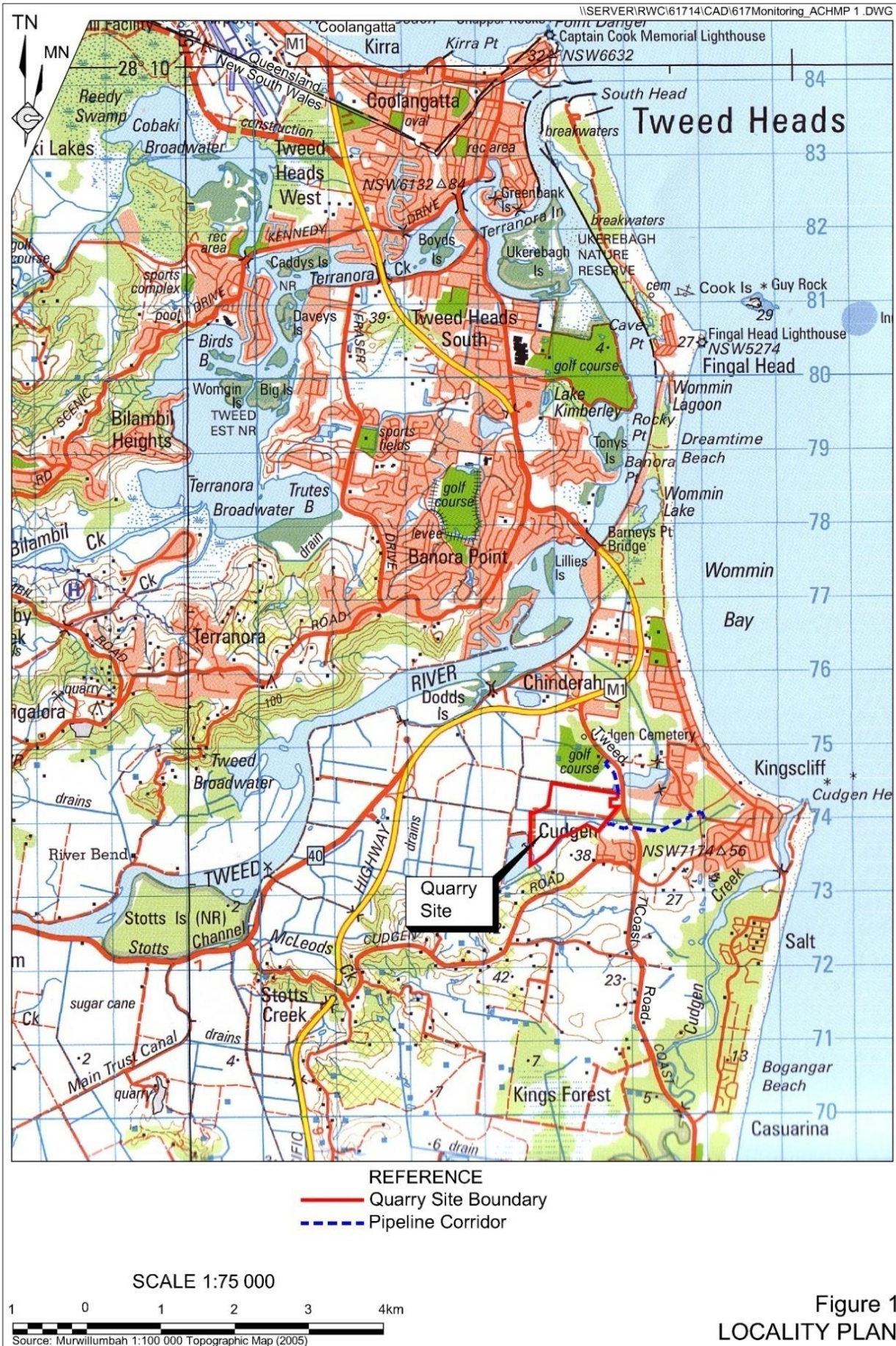
Figure 1 LOCALITY PLAN